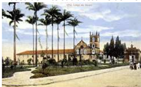
Carmo Church, Itu-SP, Brazil - Century 18 (postcard, 1910)