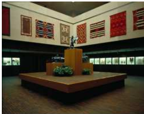
Lobby, Stark Museum of Art, Orange, Texas, USA.