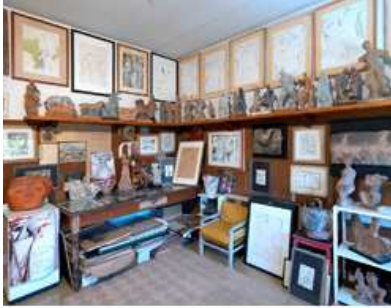
Studio of the Museo Ugo Guidi