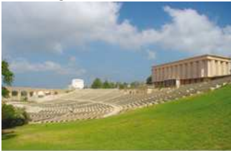
Ghetto Fighter House: © Ghetto Fighter House