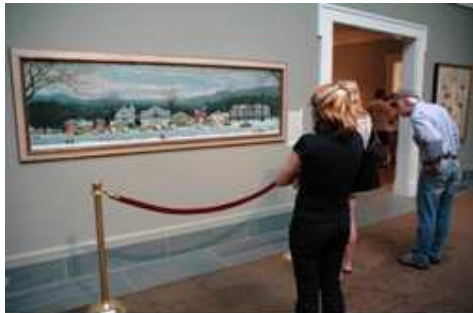
Norman Rockwell Museum visitors view Rockwell's painting, Golden Rule © 1961 SEPS : Licensed by Curtis publishing, Indianapolis, IN.