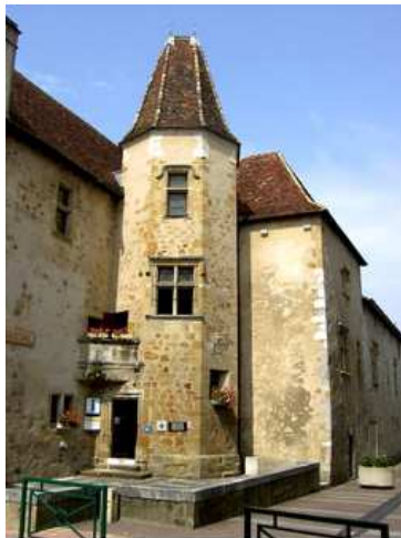
« Maison Jeanne d'Albret »