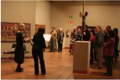
Museum night at the Museu episcopal de Vic

Museu Episcopal de Vic International Museum Day Activities (from Saturday 14th until Wednesday 18 th )