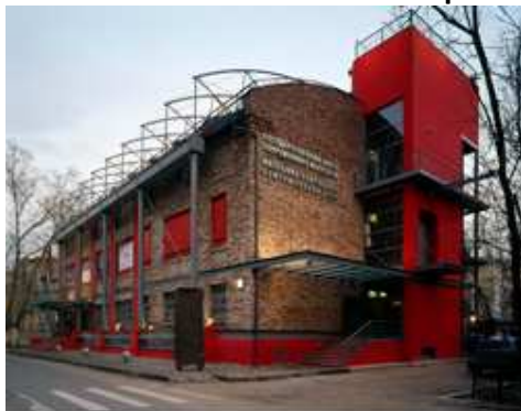
The building of the NCCA, Moscow