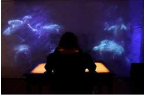
Museo Laboratorio della Mente