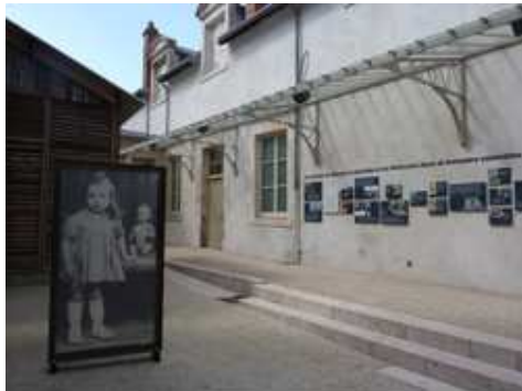
Cercil Museum Courtyard - Mémorial des enfants du Vel d'Hiv