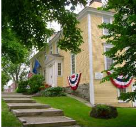
The Ladd-Gilman House, c. 1721, one of two buildings comprising the American Independence Museum which tells the story of America's struggle for freedom and its founding.