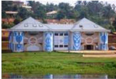
Musée des civilisations in Dschang (Main facade)