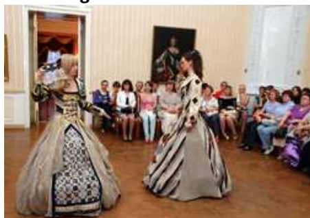
Theatrical Performance