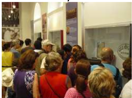
Visits at the MUHM