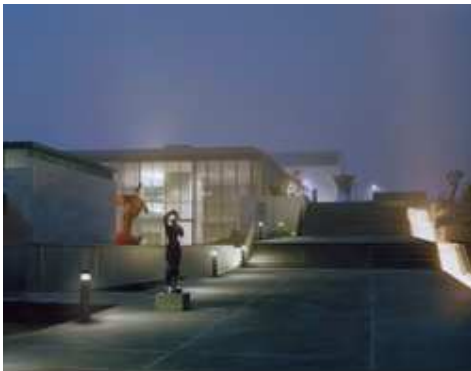
Nighttime view of the Israel Museum's new gallery entrance pavilion from Carter Promenade, including Claes Oldenberg and Coosje van Bruggen's "Apple Core" and Anish Kapoor's "Turning the World Upside Down".