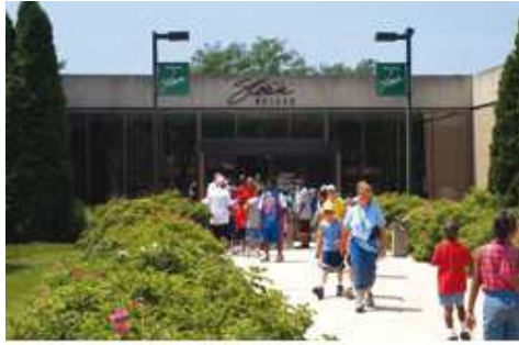
Sloan Museum is a place for families to have fun !