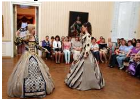
Theatricalized Performance