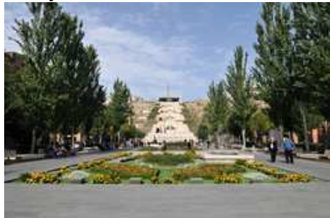
Cafesjian Center for the Arts