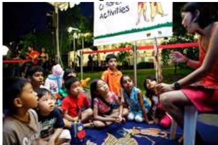
Singapore Peranakan Museum