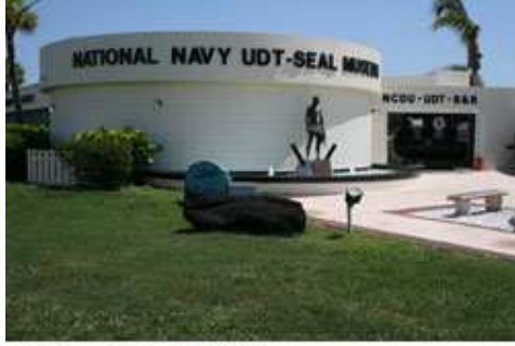
National Navy SEAL Museum