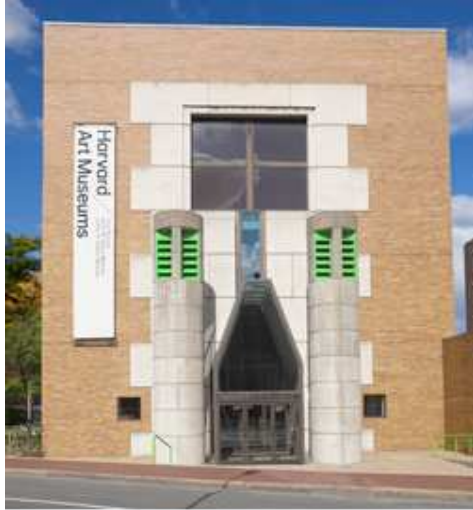
Harvard Art Museums. Arthur M. Sackler Museum, Cambridge, MA.