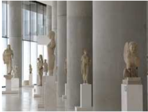
Exhibition space at the New Acropolis Museum, Athens, Greece.

Exhibition: "...constructing memory while reconstructing museology".