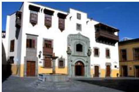
Facade of the Casa de Colón, Square of the New Pillar