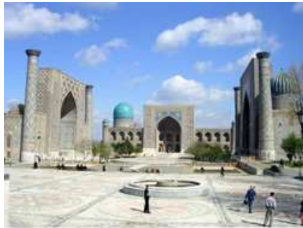
Registan Square - the ancient forum of Samarkand.