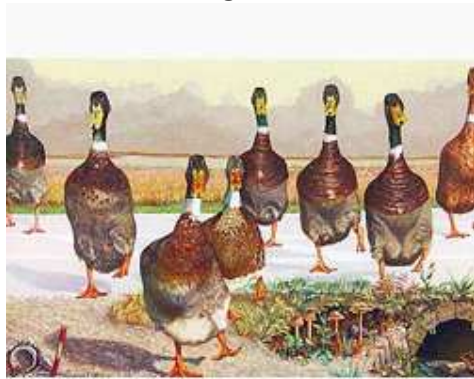
Runnerducks: oil by Sulpicius Bertsch