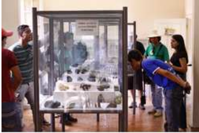
Activities of the Museu de Ciências da Terra Alexis Dorofeef.