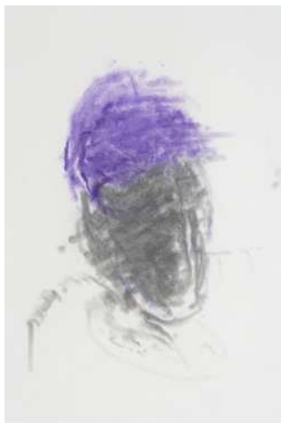
Adriana Šimotová: From the cycle Heads – Head in the wind, detail, 2009, graphite, pastel, pigment, 100x70 cm