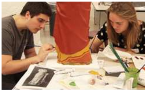
Stanford students work on a replica sculpture for True Colors: Rediscovering Pigments on Greco-Roman Marble Sculpture.