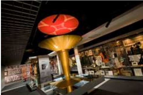
The 1956 Melbourne Olympic Games Cauldron in the Faster, Higher, Stronger Gallery of the National Sports Museum