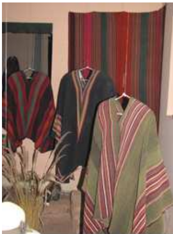
Ponchos of the central región of the country. Dept. Potosí © Archives MUDEP.