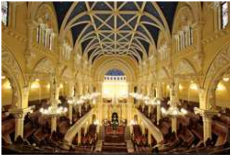
Interior view of The Great Synagogue, Sydney.