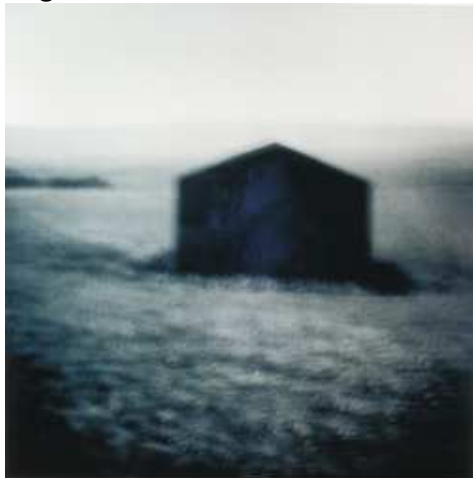
Michal Rovner, Outside , no. 17, 1991. © Michal Rovner