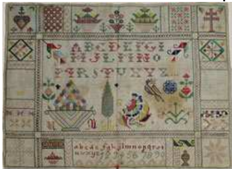
Collection textile pedagogical