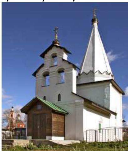
Lytkarinsky Museum