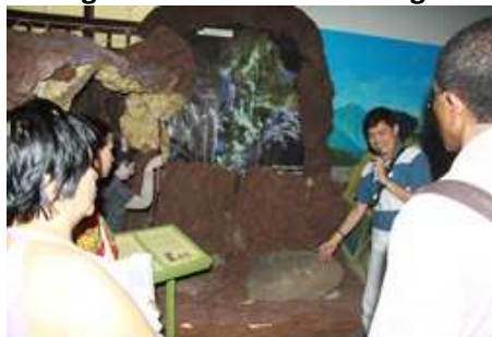
International Museum Day in Sorsogon