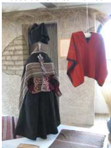
Traditional dress aymara de mama thalla. Region Aroma, dept. La Paz, Bolivia.