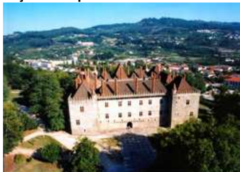
Paço de Duques