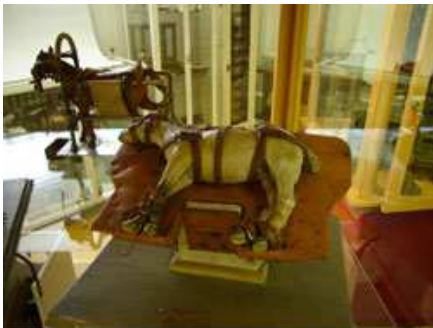
1914 Operation Schneider Bed model

Military veterinary historical material (Monday to Friday from 9.30am to 2pm. For groups, arrange a visit)