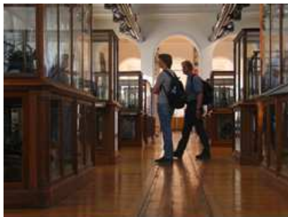
Visitors at the Musée des Arts et Métiers