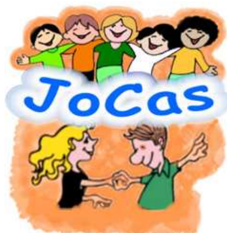
Logo Historisch Museum JoCas.