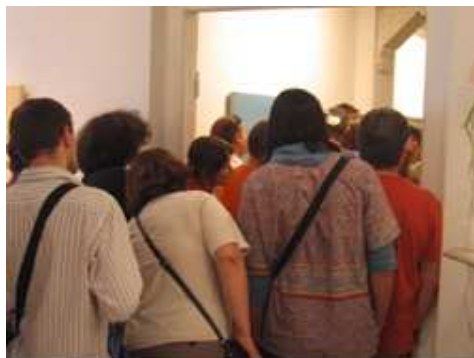
Exploring contemporary art in the museum.