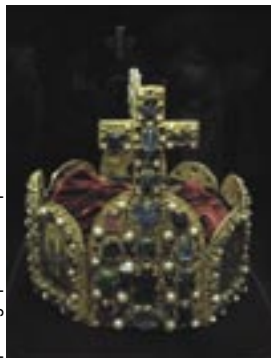
Vienna, Imperial Treasury