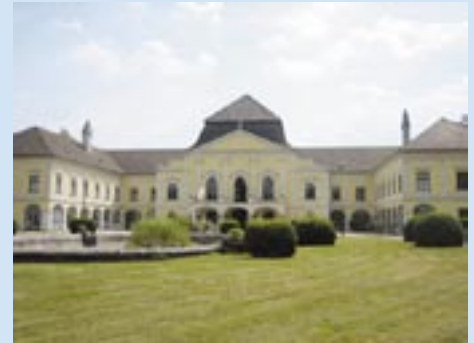
Ethnografisches Museum Schloss Kittsee