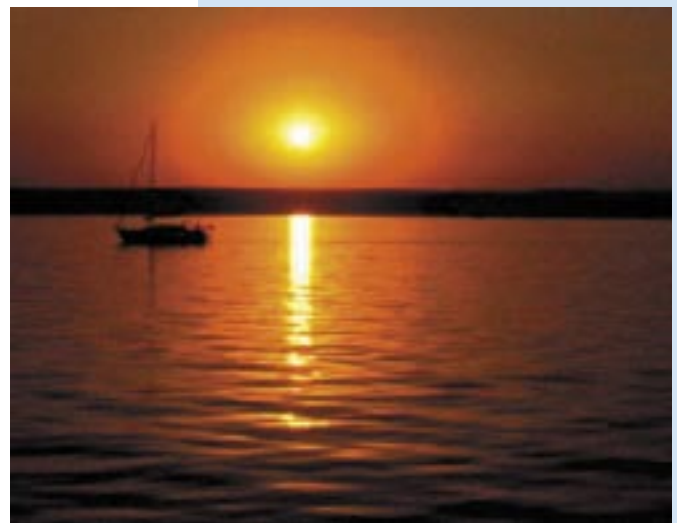
Kunsthistorisches &amp; Naturhistorisches Museum Vienna