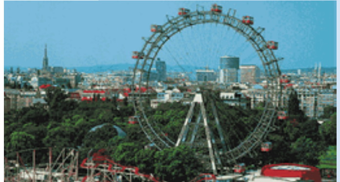
"Riesenrad" in Vienna