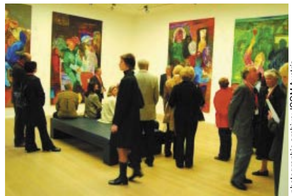
Admont, Monastery and Museum