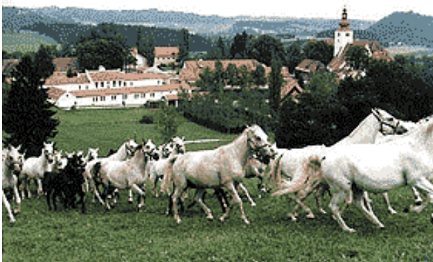
Piber, Stud farm of Lipizzan horses and Museum

Services incl. (p.pers.): accommodation incl. breakfast (double room), transfer, various entrance fees, lunch and dinner, drinks (partly)