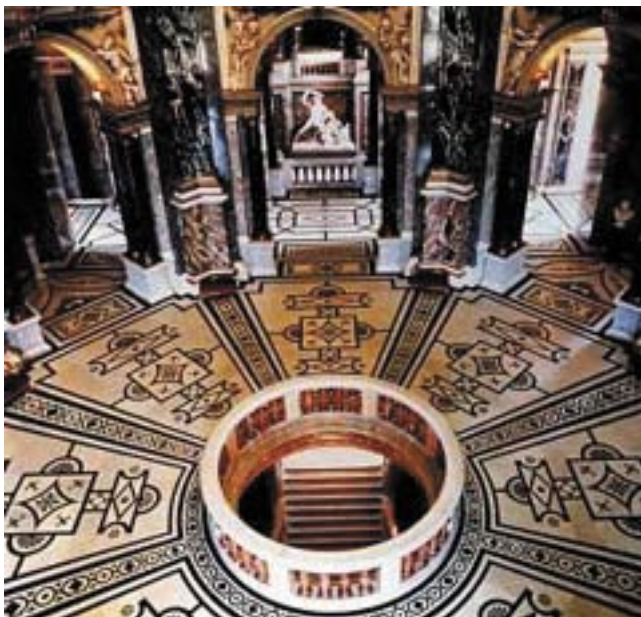
Vienna, Kunsthistorisches Museum, Middle Hall

Mercredi est l'ICR-JOUR hors. Tous membres de ICR sont invités à participer à l'excursion à Burgenland, un de provinces d'Autriches ferme à Vienne. Nous visiterons les expositions dans le Musée de Ethnografic dans le Château de Kittsee. Dans le petit musée de village « Dorfmuseum Mönchhof » nous verrons l'architecture typique de cette région et nous avons à goûter des vins et la nourriture typique de là-bas. Le point prochain de visite est le moulin à vent dans Podersdorf. A la