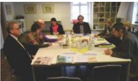
ICR Board meeting, Schleswig (Germany), February 2011. Volkskunde Museum