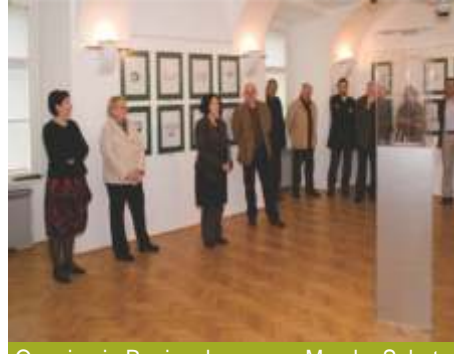
Opening in Regional museum Murska Sobota (Slovenia), May 2010