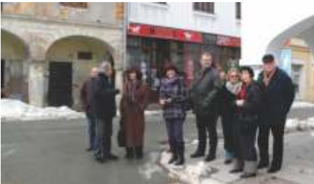
ICR board visiting Vukovar during the board meeting in Croatia 2010