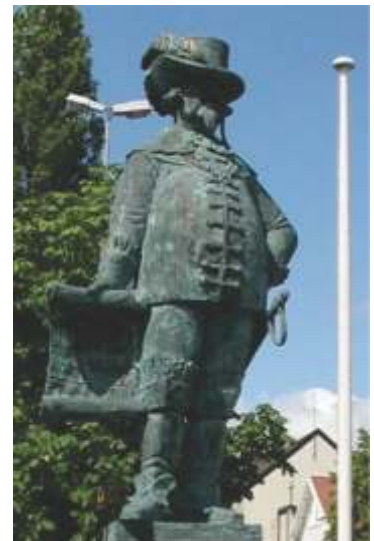
Statue of King Christian IV the founder of Kristiansand

Details of the conference programme and registration form can be found in ICR's newsletter and website: www.icr-icom.org