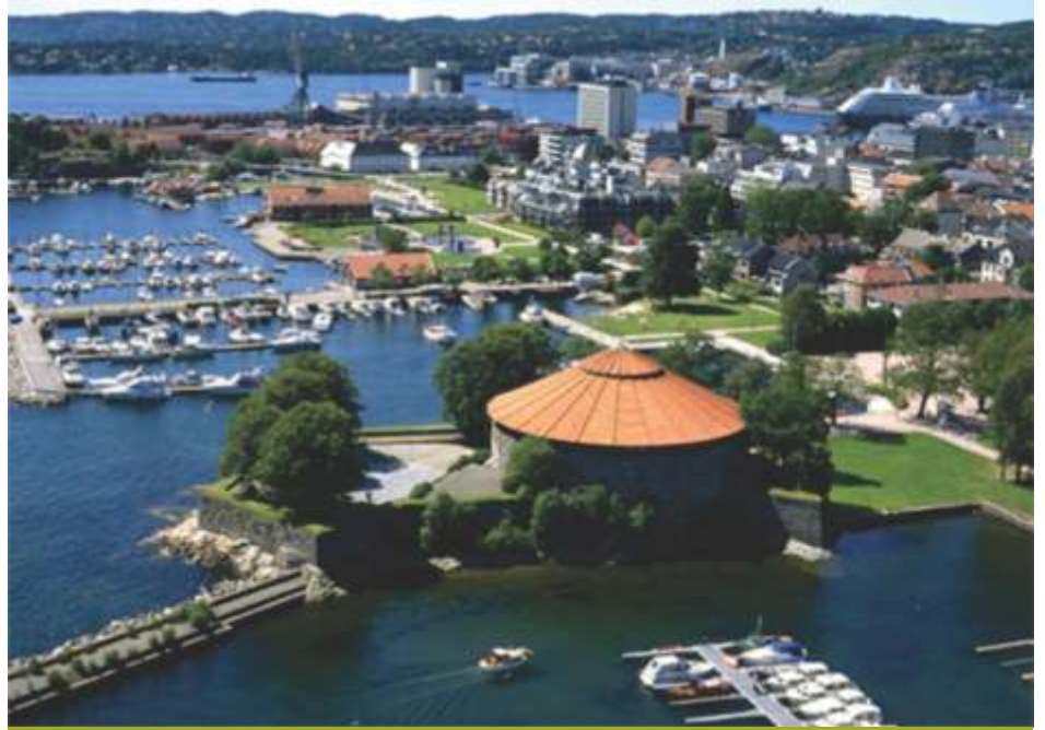
City of Kristiansand. The Kristiansand Fortress dates back to 1672.