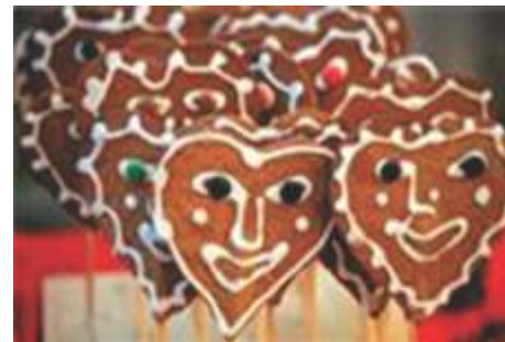
Gingerbreads in the Christmas Market at Fort Nordberg

planteen cuestiones tales como el papel de los museos para apoyar el resurgimiento y la promoción de la gastronomía regional; los retos para presentar la historia de la comida local mientras nos preocupan la salud, seguridad y las regulaciones de higiene; asociaciones efectivas para promover iniciativas de turismo gastronómico, manejando al mismo tiempo temas como la obesidad, hambre, escasez de alimentos y/o alcoholismo.