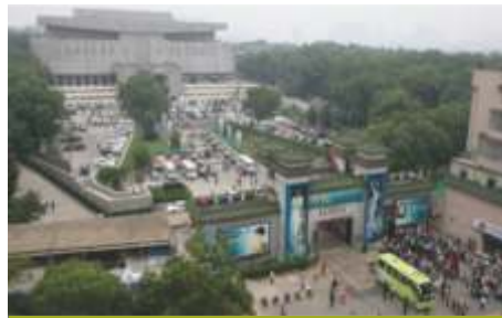
Host of ICR during the ICOM/ICR General Conference in Shanghai was Hunan provincial museum