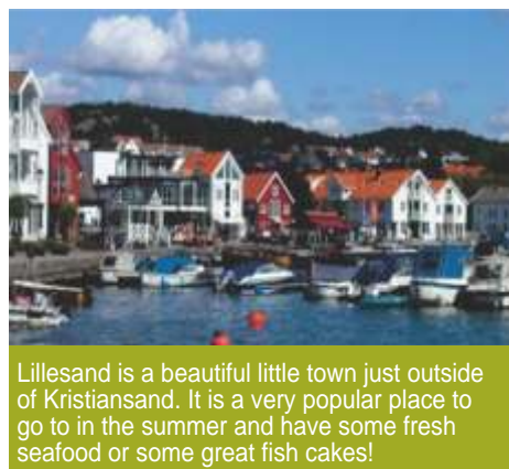
Lillesand is a beautiful little town just outside of Kristiansand. It is a very popular place to go to in the summer and have some fresh seafood or some great fish cakes!

Every region has developed distinctive patterns of eating and drinking in response to the natural resources available in its physical environment. However, rapid development, globalisation and international fast food are rapidly overtaking local dishes, eating houses and family food practices. Nevertheless movements such as "Slow Food" are reclaiming locally grown ingredients and traditional recipes, while the popularity of television cooking programmes and well-researched cookery books show that public interest in regional foods and drink is strong. ICR suggests that regional museums can add new dimensions to our understandings of the inventiveness of cooks, gardeners, fishermen, farmers and hunter-gatherers across time and across cultures. Almost every museum holds some food-related material in their collections: still-life paintings, farm tractors, kitchen utensils, plant and animal specimens, traditional table textiles, cookbooks, historic photographs recording wedding feasts, fish nets used by indigenous cultures and pottery from archaeological contexts.