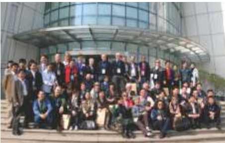
ICR group in front of the QingPu Museum during the ICOM/ICR General Conference, Shanghai (China), 2010