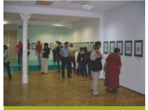
Opening in Museum for recent history Celje (Slovenia), June 2010