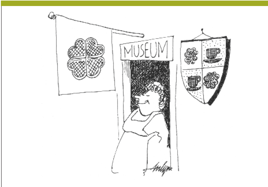
The demand on museums to earn more money means that they all serve coffee and waffles.