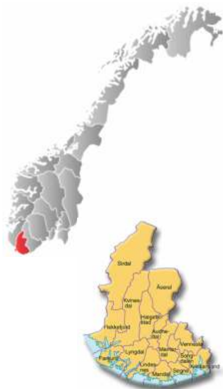
Vest – Agder County