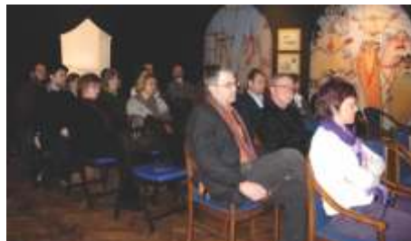
Presentation of ICR book: Regional museums and the development of communities, Museum of Slavonia, Osijek (Croatia), March 2010