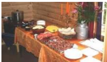
Aseral Tradisjonsmat makes cured meats using recipes that have been handed down in the family for generations

ICR is looking for papers dealing with these and other questions that can help us be creative in the ways our museums address the history and culture of food production and consumption. We are looking for examples of good practice, successful exhibitions, events and educational activities using museum collections and local talent.