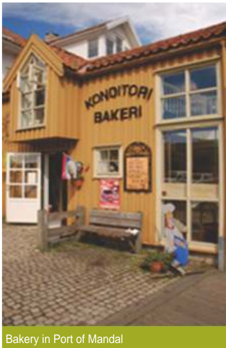
Bakery in Port of Mandal