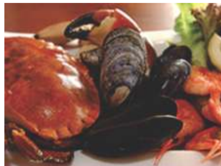
Seafood from the fishmarket in Kristiansand