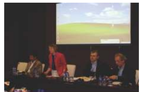
ICR Plenary session: Museums for Social Harmony, Shanghai (China), November 2010