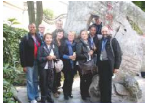
Part of the ICR board in Zhujiajiniao Town (China)