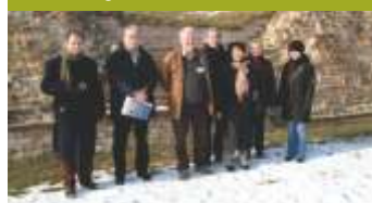
Part of the board visiting Danewerk wall and Danish minority museum

ICR News is published by ICR, the International Committee for Regional Museums