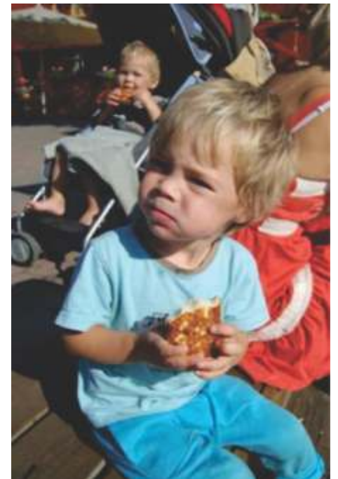
Children of Kristiansand

ICR busca trabajos relacionados con estas y otras cuestiones que puedan ayudarnos a ser creativos en las formas en las que nuestros museos abordan la historia y la cultura de la producción de alimentos y su consumo. Estamos buscando ejemplos de buenas prácticas, de exhibiciones exitosas, eventos y actividades educativas usando colecciones de museos y talento local. Las ponencias sobre el tema general podrán disponer de 15 minutos. Los estudios de caso con ejemplos de museos y programas de capacitación, máximo 10 minutos. Las presentaciones no deben exceder el límite de tiempo correspondiente.